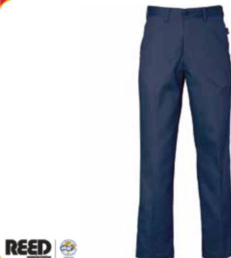
381PFU9 88/12 Cotton Blend Flex Pant