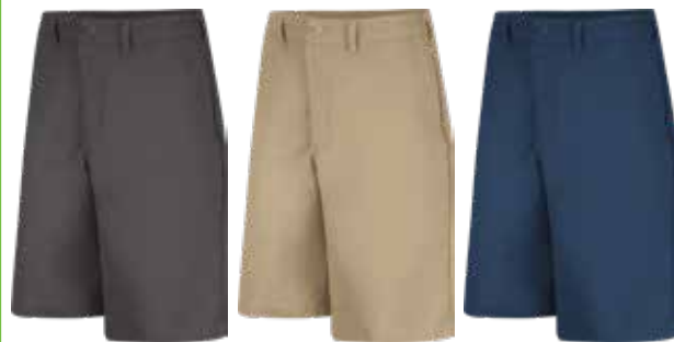
PT42 Flex Waist Plain Front Short