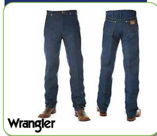
13MWZ Cowboy Cut Original Fit Jean