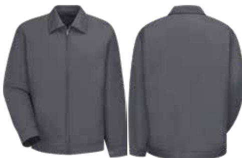
JT22 Slash Pocket Jacket