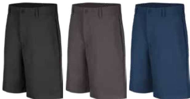
PT26 Plain Front Short