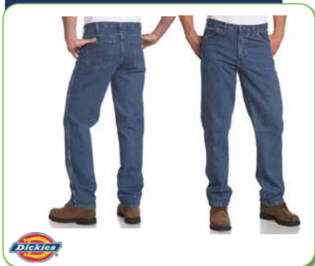
C993 Regular Fit Jean