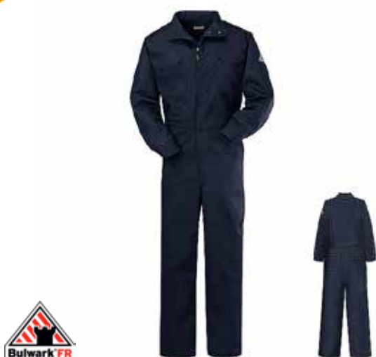
CLB2NV Premium Coveralls