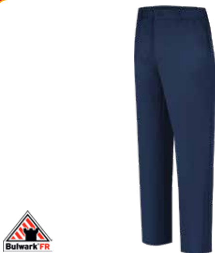
PLW2NV 88/12 Cotton Blend Pants