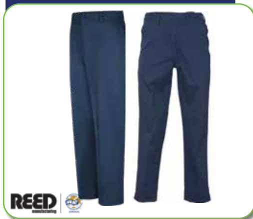
381P Work Pants