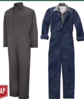
CT10 Twill Action-Back Coverall