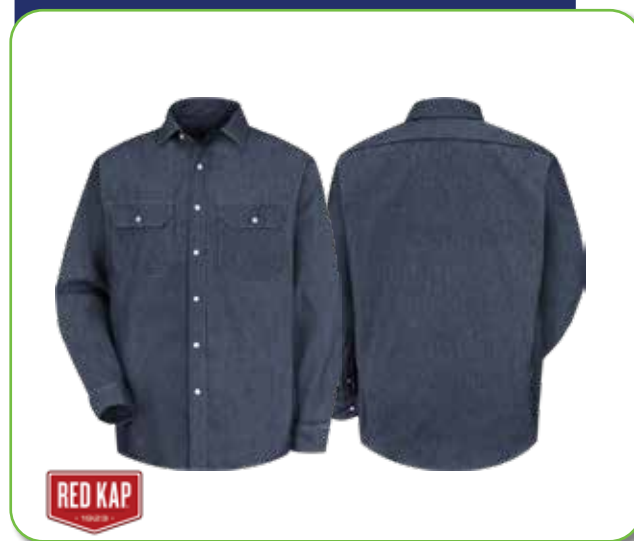
SD78 Denim Work Shirt