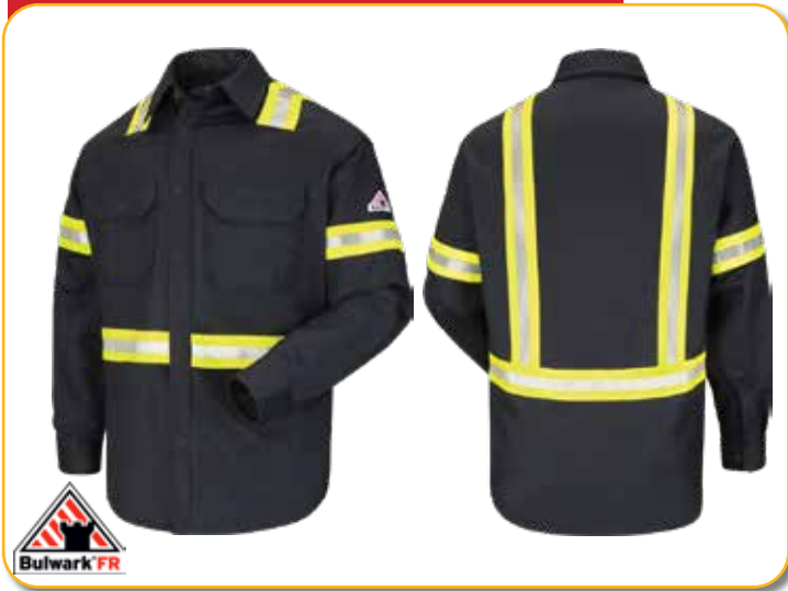
SLDTNV Enhanced Visibility Shirt