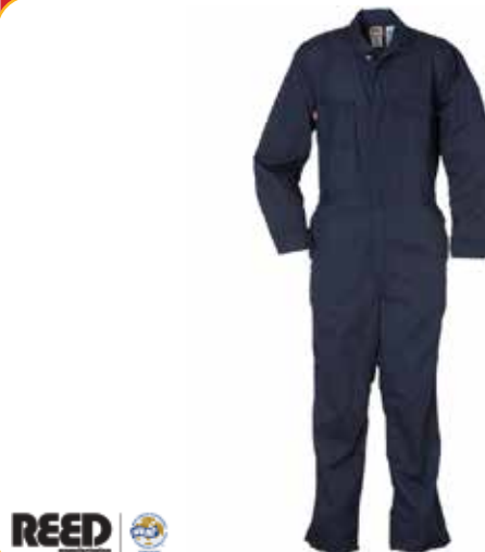
941CFU7 88/12 Deluxe Coveralls