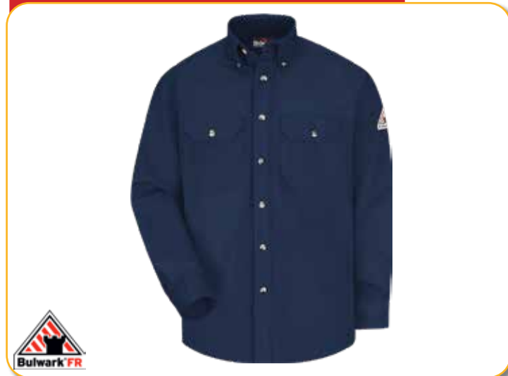
SLU2NV 88/12 Cotton Blend Shirt