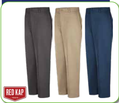
PC20 Cotton Work Pants