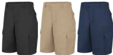
PT66 Cargo Short