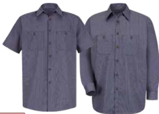
SP20/10 EX Blue / Charcoal / Check