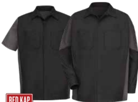
SY20/10 Black / Charcoal