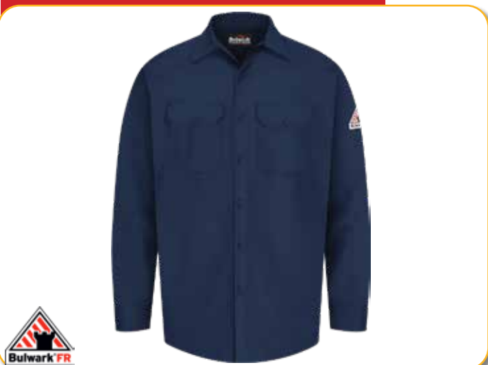
SEW2NV Cotton Shirt