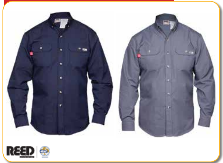
FRG5 Flame Resistant Shirt Navy/Grey