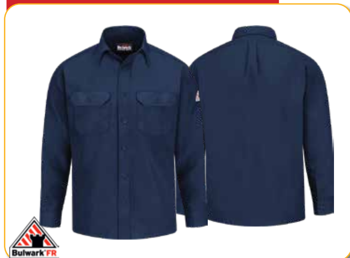
SND2NV Lightweight Nomex Shirt