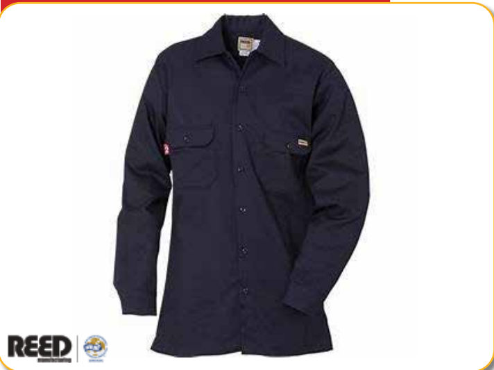
9881FU7 88/12 Cotton Blend Shirt