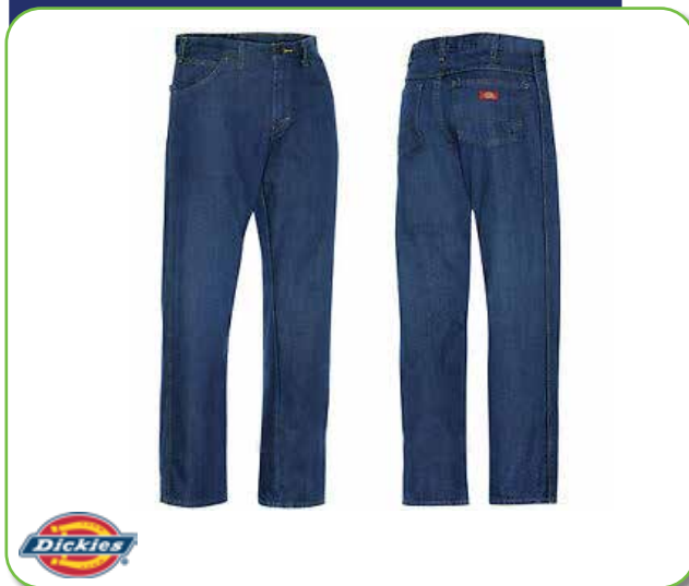
CR393 Relaxed Fit Jean